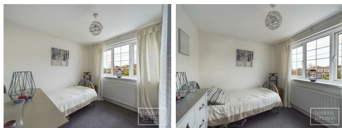
Bedroom 3 10'1" x 8'10" (3.09 x 2.70)

Double glazed window to rear, radiator, built in double wardrobe.