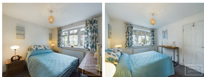
Bedroom 2 10'8" x 9'4" (3.27 x 2.86)

Double glazed window to front, radiator, built in double wardrobe.