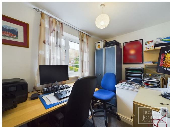
Bedroom 4 10'2" x 6'10" (3.12 x 2.10)

Double glazed window to front, radiator.