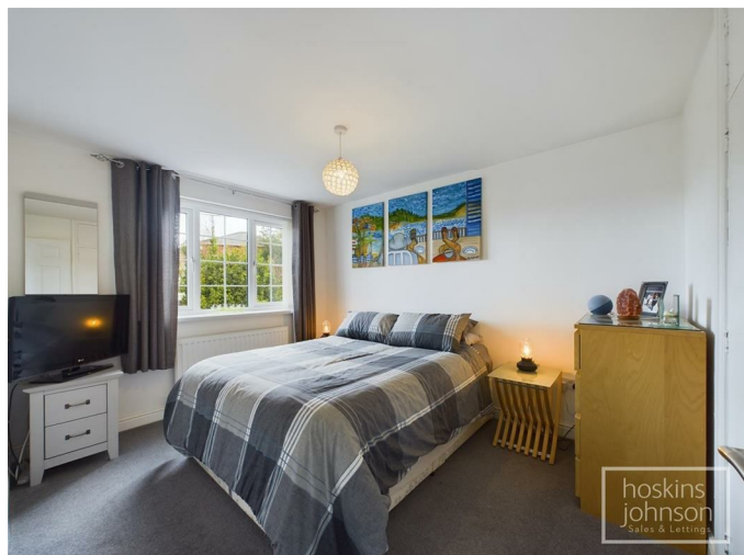
Bedroom 1 11'10" x 9'4" (3.61 x 2.87)

Double glazed window to rear, radiator, built in double wardrobe.